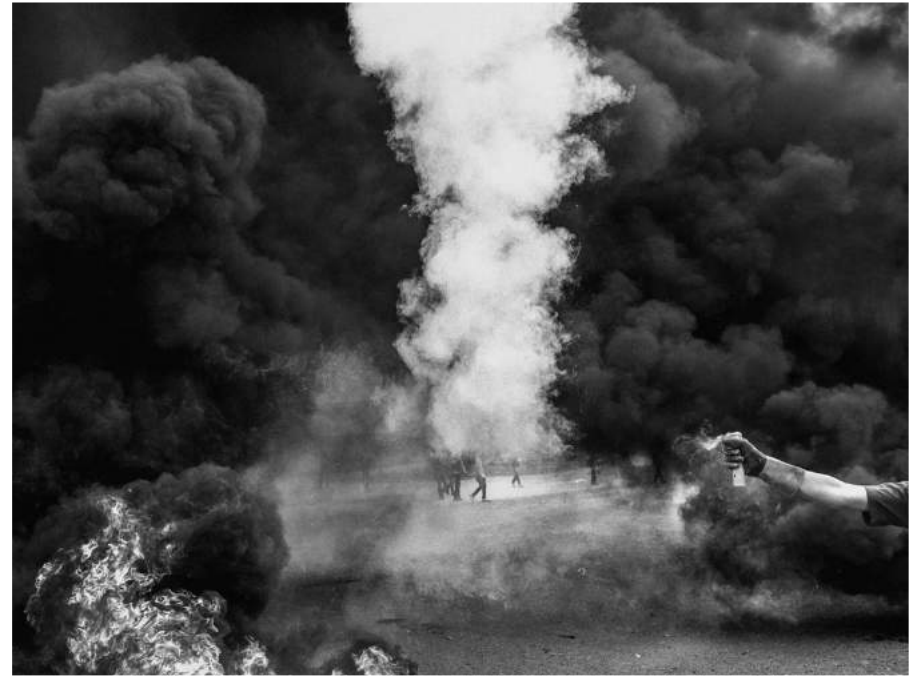
From Furkan Temir's Louder Than Bombs portfolio