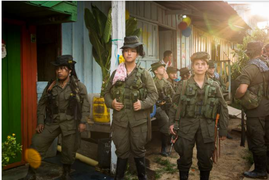
From Nadège Mazar's FARC portfolio